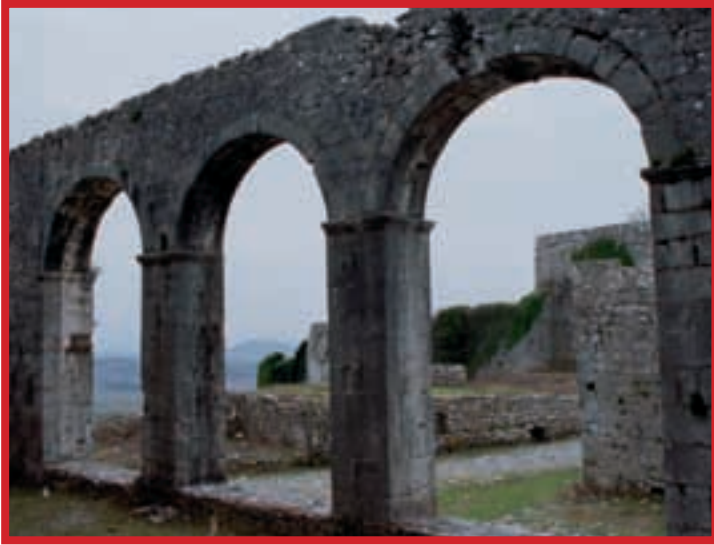
Old ruins in Shkodra