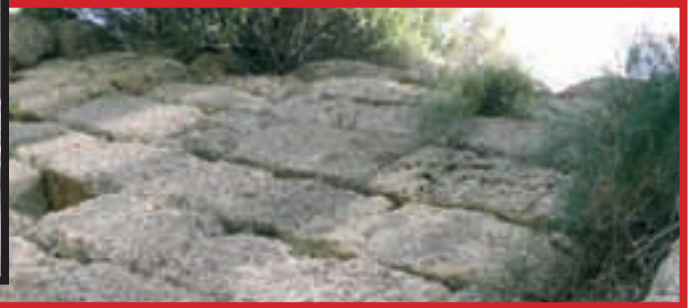
Albanopolis Ruins

period characterized by the influence of Italy in all sectors of life in Albania, because of economical, commercial, and military relationship established with Italy. Italian architects changed the face of Tirana conceiving diversely from before: a square at the centre "Scanderbeg Square", as well as Architectonic Complex of Boulevard, which represent particular architectonic values.