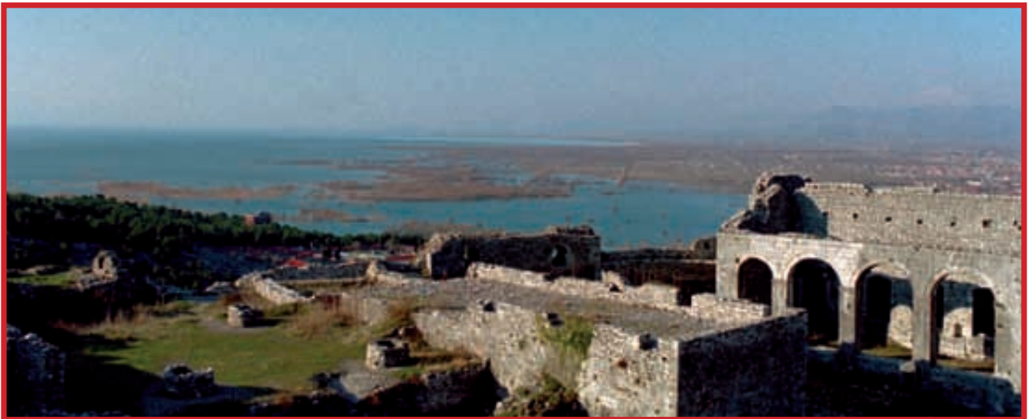
Shkodra Castle

Some other buildings of Italian architectural style, such as Polytechnic University, Hotel "Dajti", the Bank of Durres, Municipality of Vlora, Library of Fier, the house of birth and childhood of Aleksander Moisi in the city of Kavaja, museum-house of the painter Van-