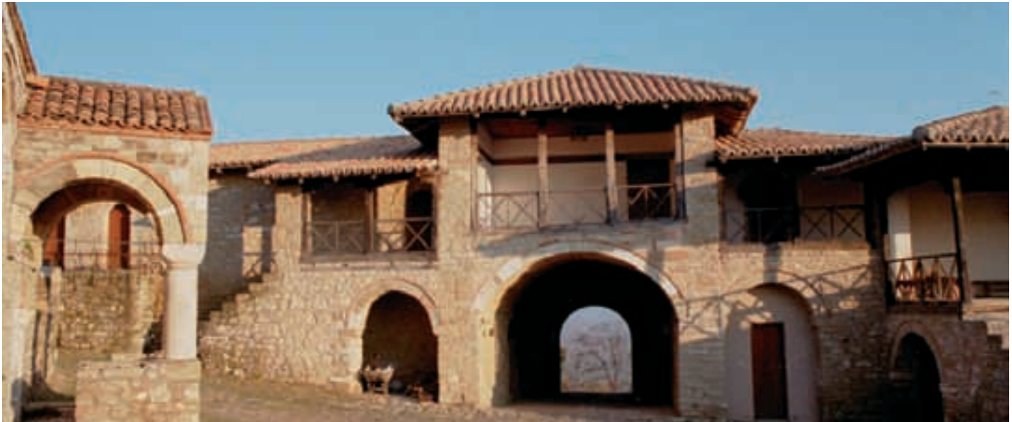
Ardenica Monastery

These objects are of significant values not only in didactic point of view, but also both informational and touristical.