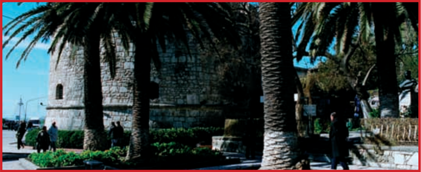
Castle in Durrës

The National Museum "Gjergj Kastrioti", in Kruja, inaugurated in 1982. This museum there is on the main portal of the castle fitting its style. A prevalent place dominates the historical objects and facts, which represent an apparent evidence of the fights led by our National Hero Gjergj Kastrioti to protect Albania from the danger of the ottoman invasion. The museum has a wide complex of sculptures referring to Scanderbeg. In it, books with old documents, relics of that time, editions and work referring to the portrait of Gjergj Kastrioti, and the history of the Al-