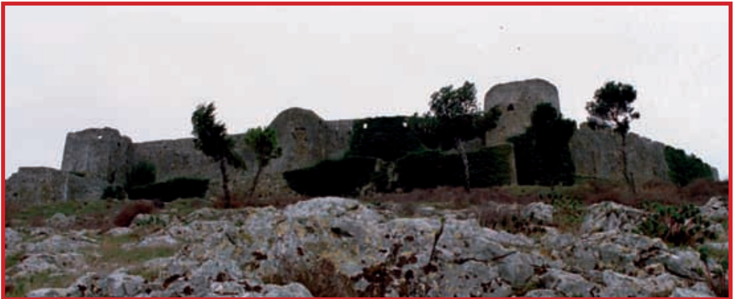
Berati Castle

In addition to National Historical Museum of Tirana, with a notable museum value, there are two other museums, in which are exposed objects of value of Byzantine and mediaeval art in Albania. One of them is the Museum of Mediaeval Art in Korca. More than 7000 objects and works of the Albanian outstan-