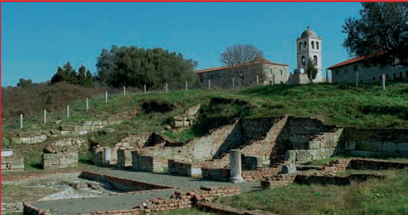
Pojan Monastery