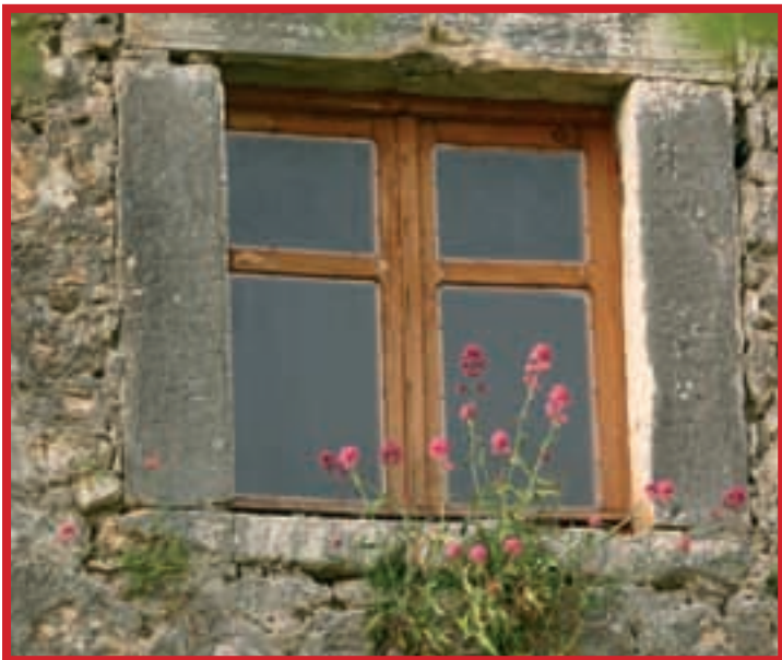
Detail, Old house

Tourists in Albanopolis, Shkodra, Berat, Foinike, etc visit remain of ancient walls. Antigonea, for discoveries that exhibit the design of the habitations is very recognized.