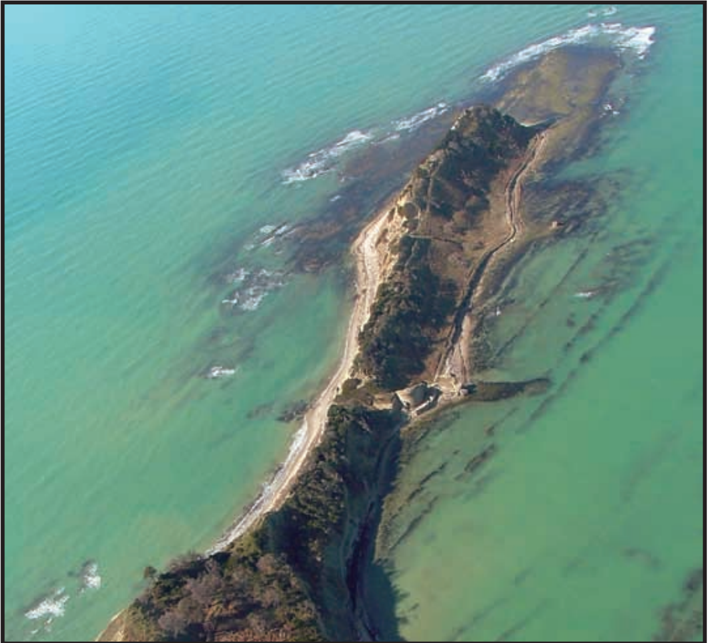
Rodoni Cape Castle