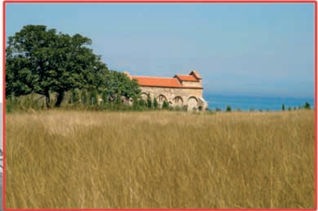
Rodoni Church

outstanding practitioner conferring his own name to a medicinal plant, that he himself practiced it. The tomb of the King Gent is in Italy, in Guvio. After three wars against the most enormous Empire of that time, Rome, in 168 BC, Illyria fell under its occupation. With the coming of the Romans, these tribes within Illyrian districts lost their independence. The Illyric