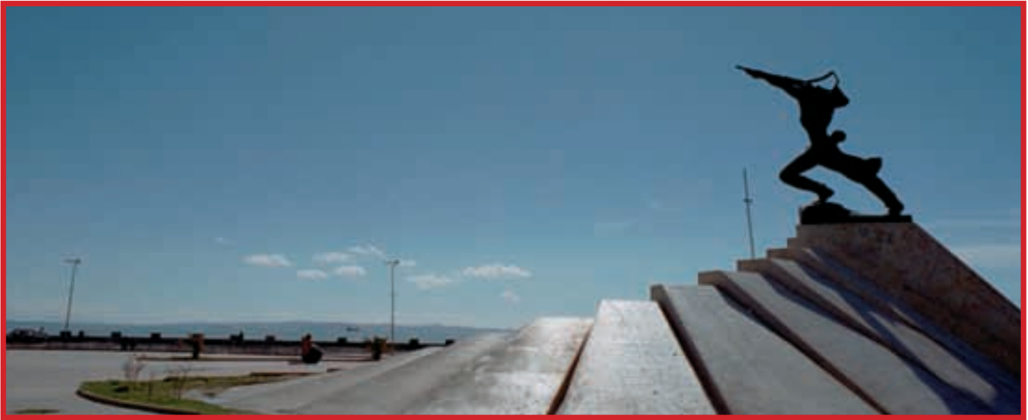
Monument in Durrës