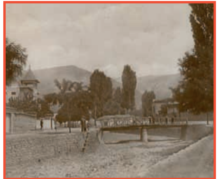
Old photo of Korca

With the decline of Roman Empire in the territory