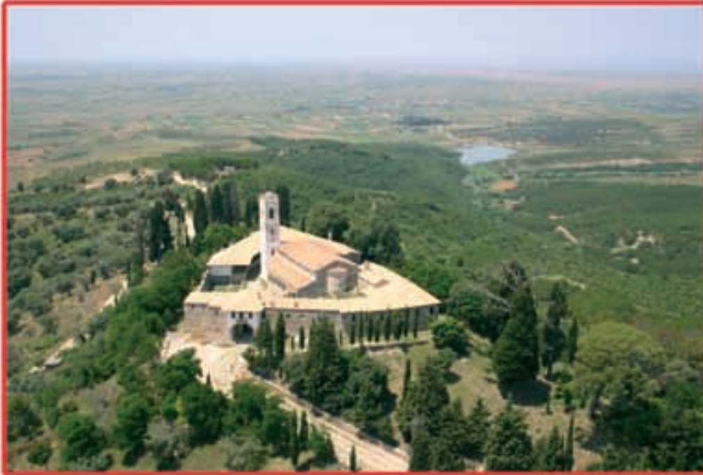
Ardenica Monastery