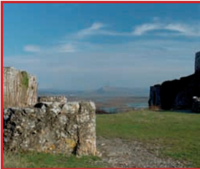
Old Ruins