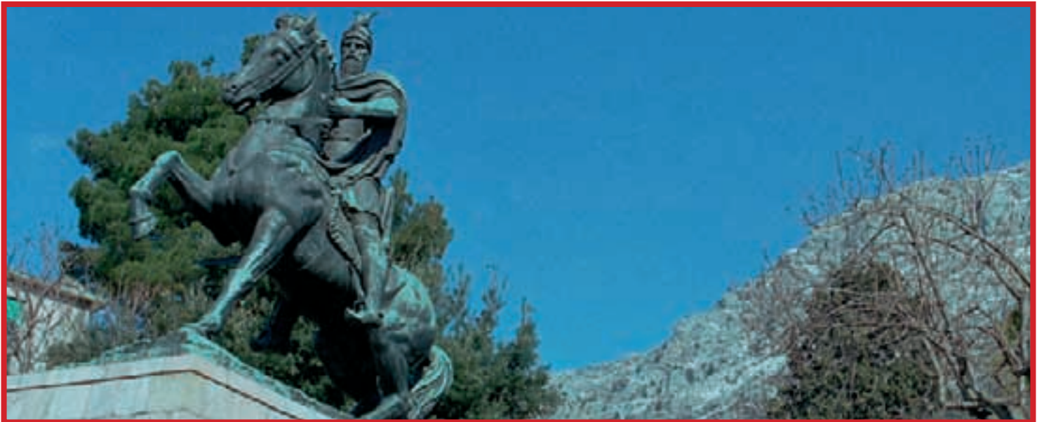
Skenderbeu Monument in Kruja

Among the most important museum, objects of this period are as follows: