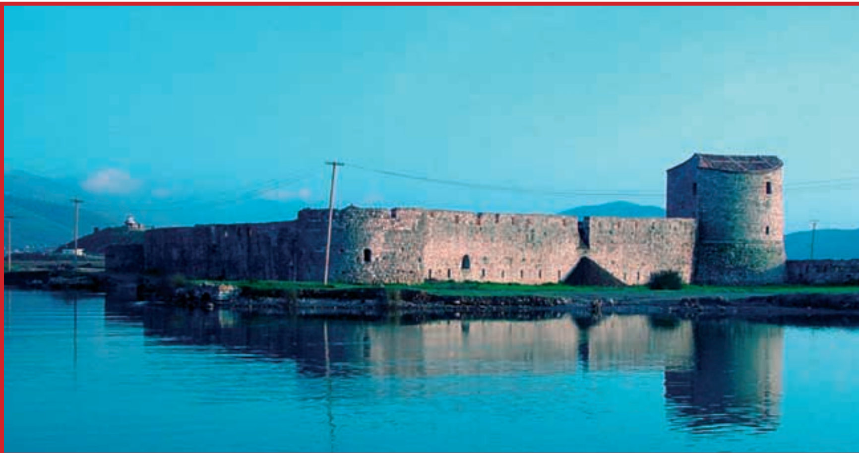
Butrinti Castle