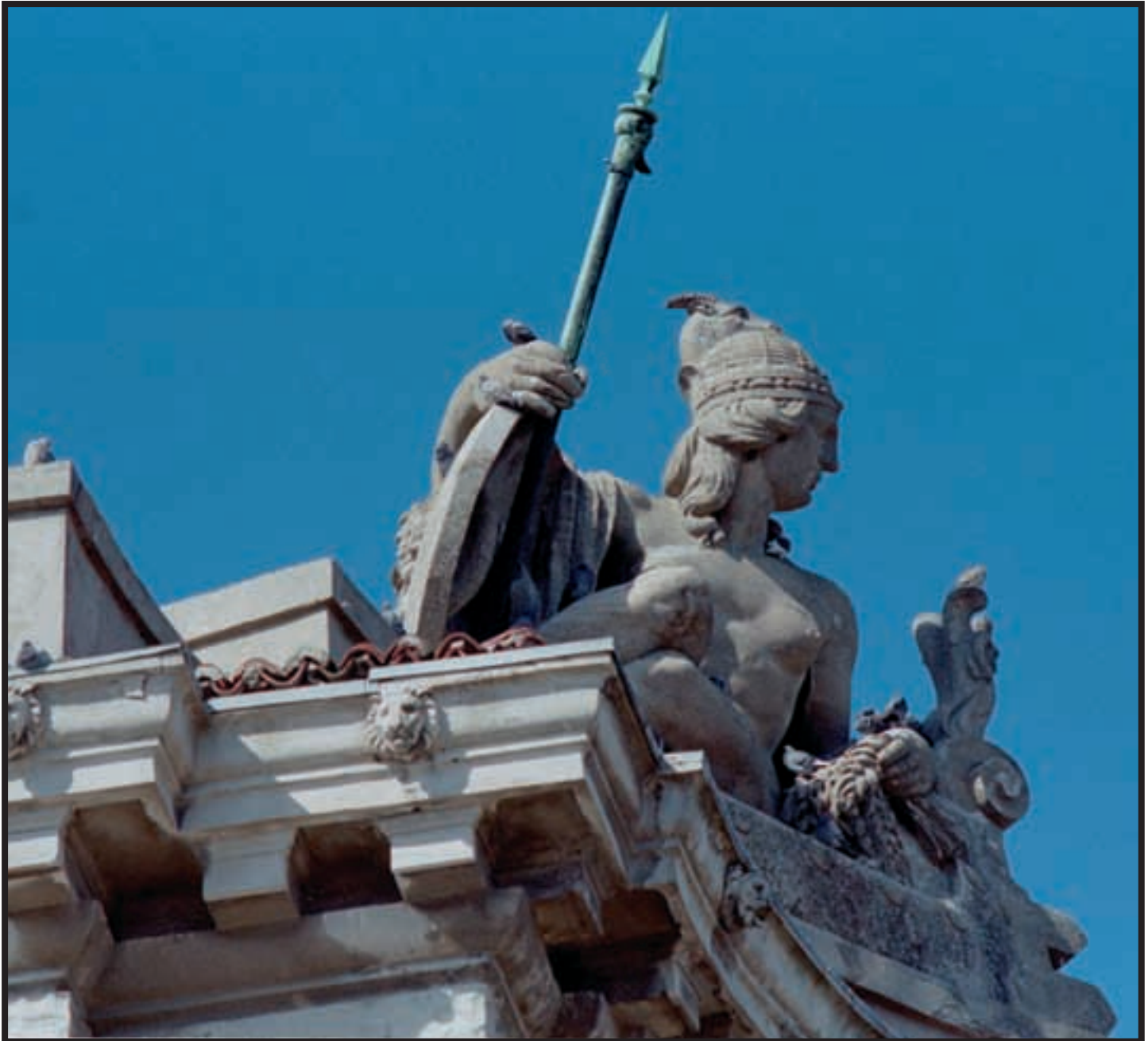
Teuta statue