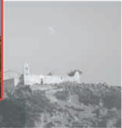
Dhërmiu Church

salonica, and in the end with Byzantium. This road became very important to connect the east with the west. The circulation in it also enabled the buildings of various habitations along it, leading to a notable increase of trade development and inciting simultaneously the Romanization of the whole Balkan Peninsula including here the Albanian districts as well. In this period is mentioned Lissus, a city that achieved a conventus civium Romanorum (corporation of roman citizens) that in the time of Julio Caesar was