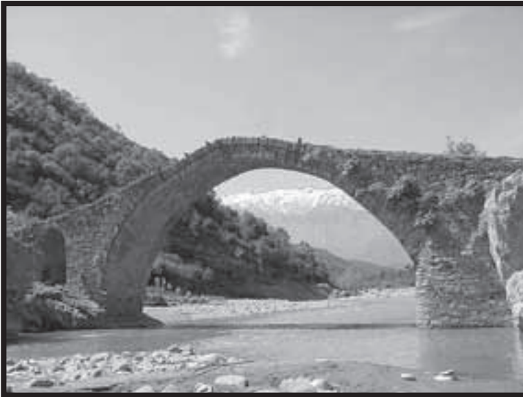
Langarica Bridge