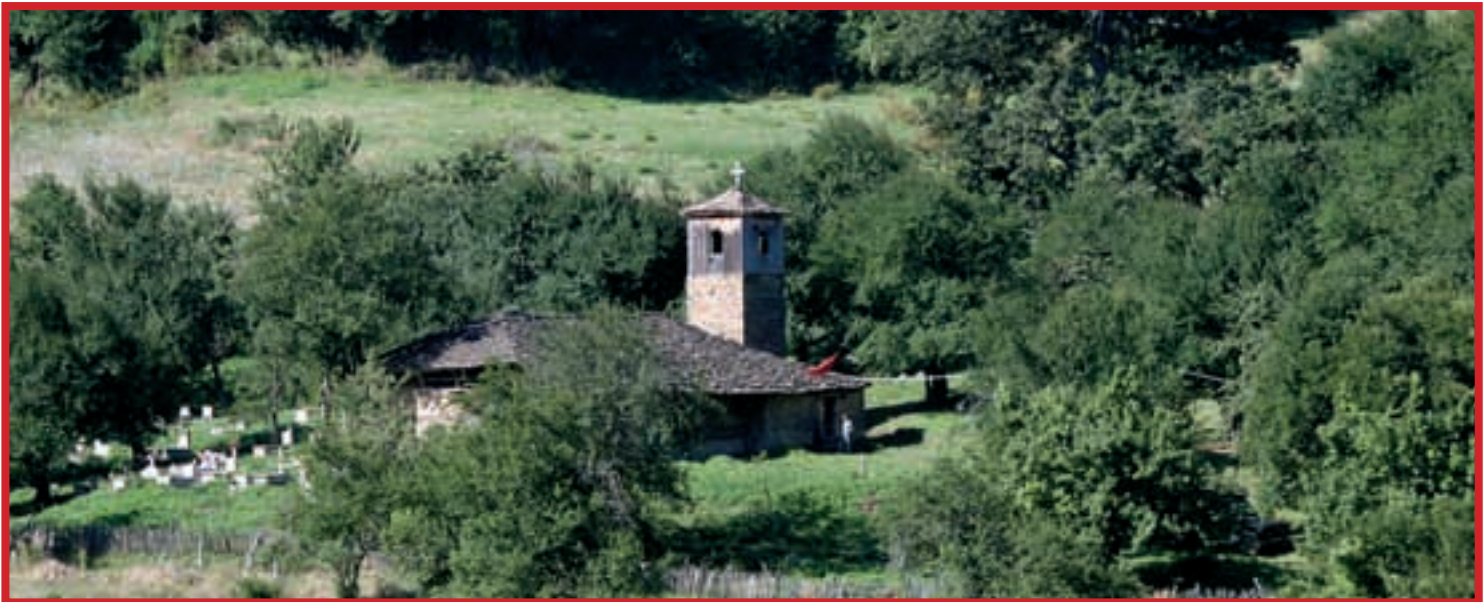
Church in Nise