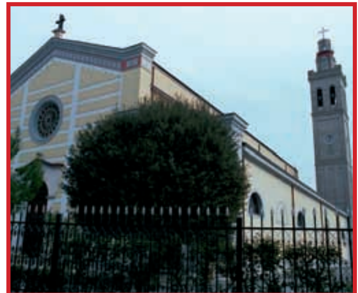
Church in Shkodra